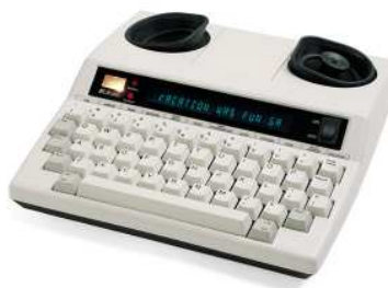
Photo of TTY machine

Persons with some hearing loss who can hear on the phone and those with speech disorders may opt to use Hearing Carry Over (HCO). In Hearing Carry Over, the Hard of Hearing person will listen to the caller’s message and respond by typing their message. The CA will then read the message to the hearing caller.