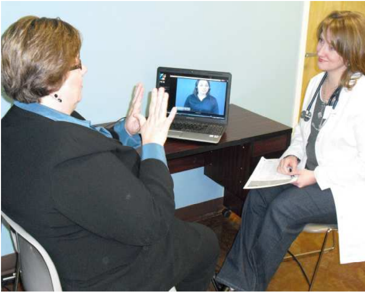
Remote Interpreter (on computer screen) voices message from the deaf user (on the left) to hearing user on the right.